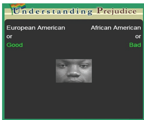
Figure 1 Screenshot of the Implicit Association Test, a test of hidden bias.

Excellence, 2010) uses multiple-choice items based on specific cultures, without any culture-general items. An example of a culture-specific item is, “When greeting a colleague from Chile, one must ...” Based on the norms of the culture and context of the situation described, the examinee selects the most appropriate response from a list of choices.