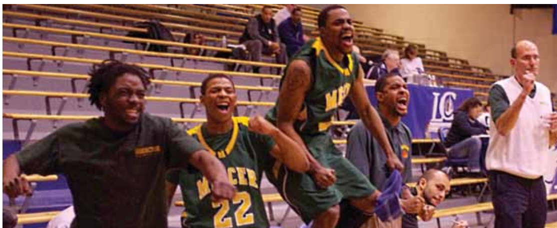
Buzzer-beating comeback versus Lackawanna creates jubilation on the sidelines.