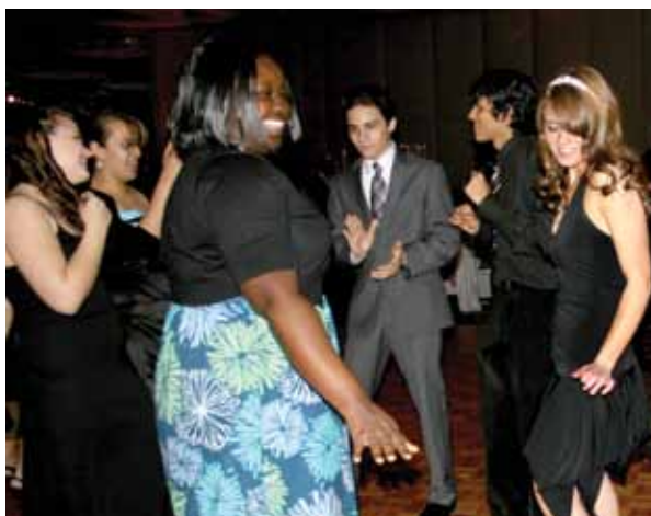
Students dance to the music of the Kenny i Orchestra.