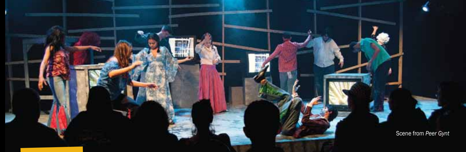
Scene from Peer Gynt

Alternates between generating new performance work and looking at the history of collaboration among established artists of different disciplines in Modernist and Postmodernist movements. Students work with the materials of their specific craft while taking inspiration from other artistic movements. The class is open to actors, dancers, musicians, media, and fine artists. Final performance project is presented in New York City.