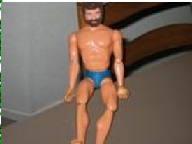
1970's GI Joe