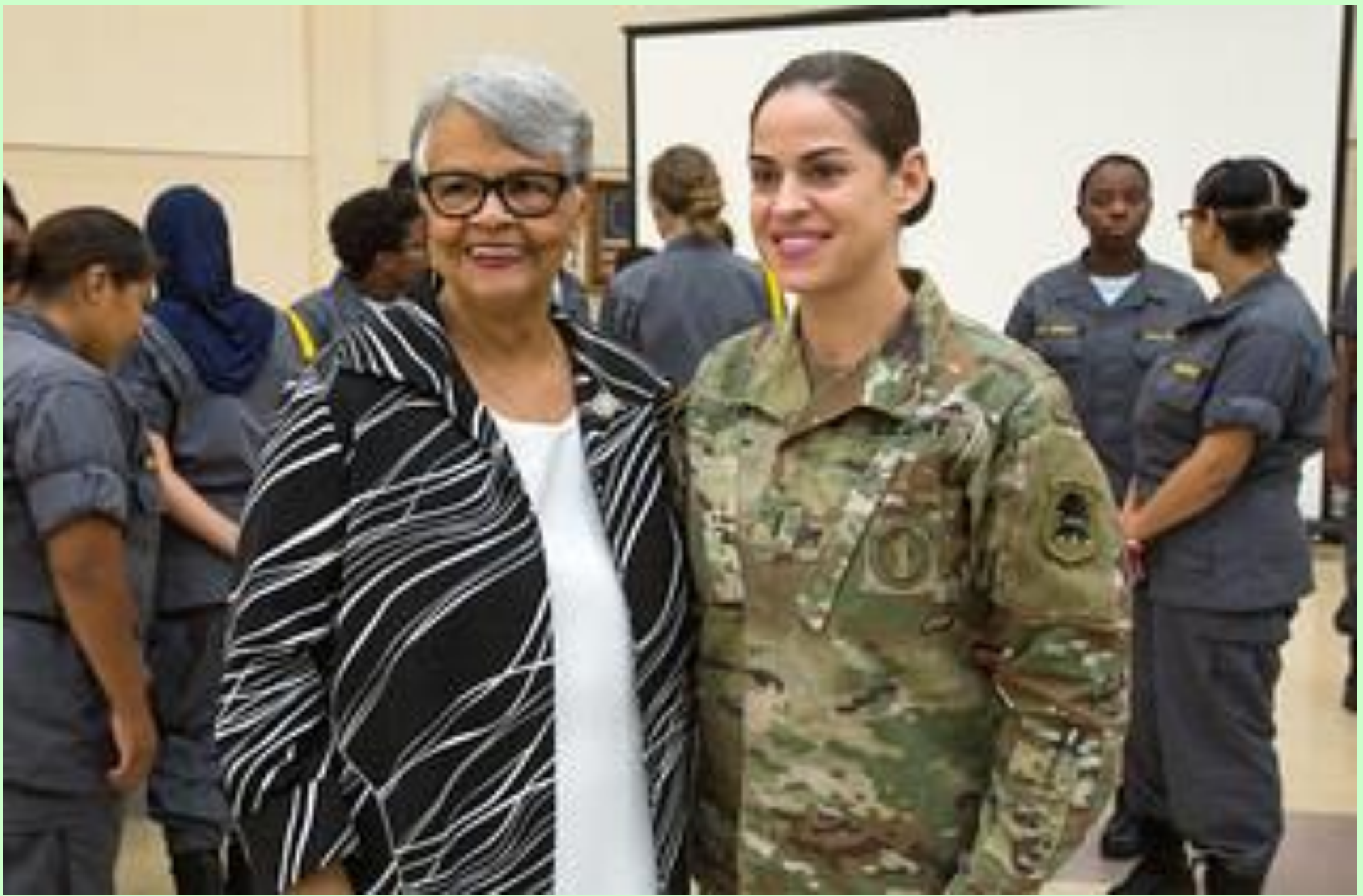
U.S. Congresswoman Bonnie Watson Coleman (D NJ-12)