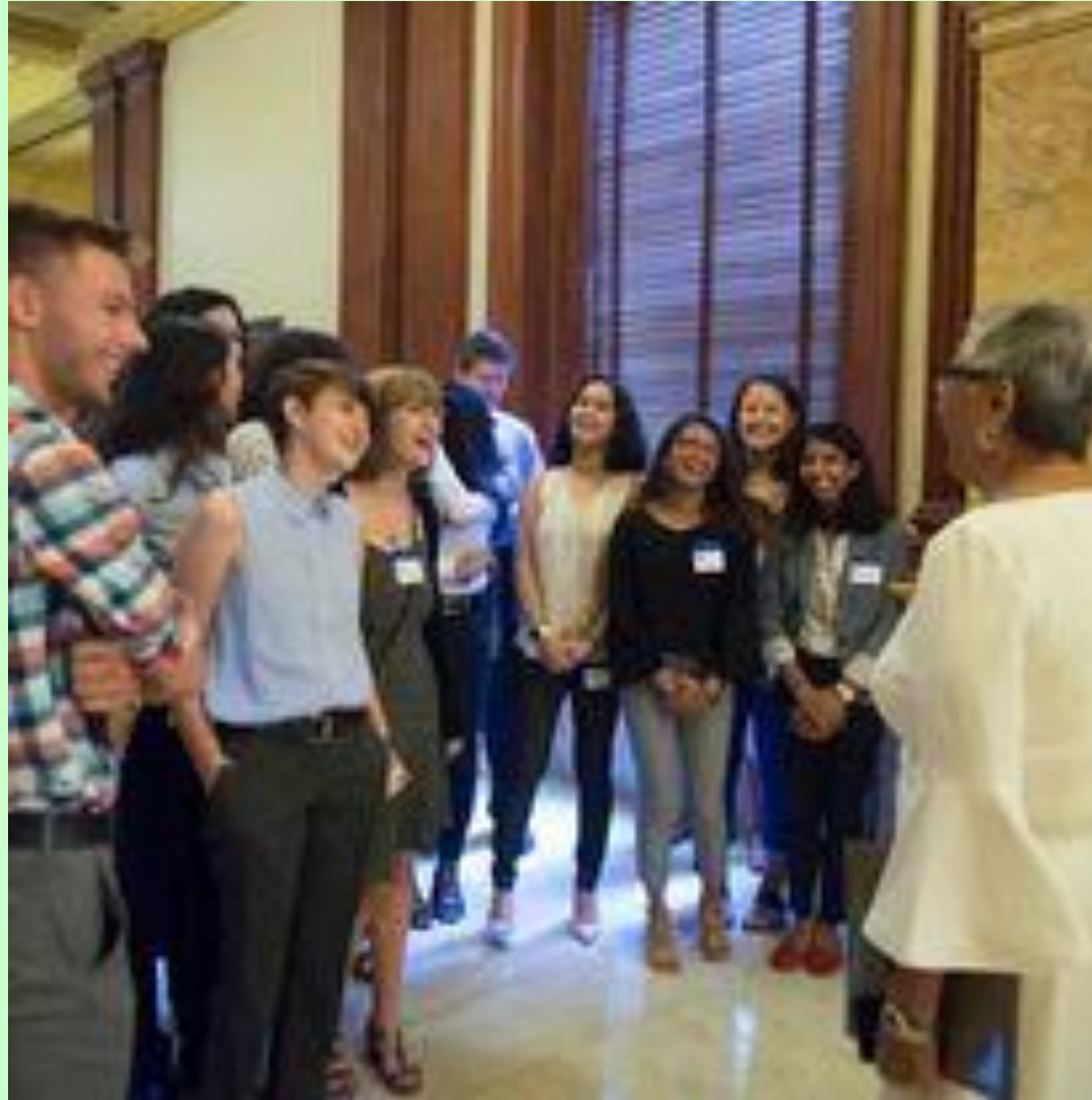
U.S. Congresswoman Bonnie Watson Coleman (D NJ-12)