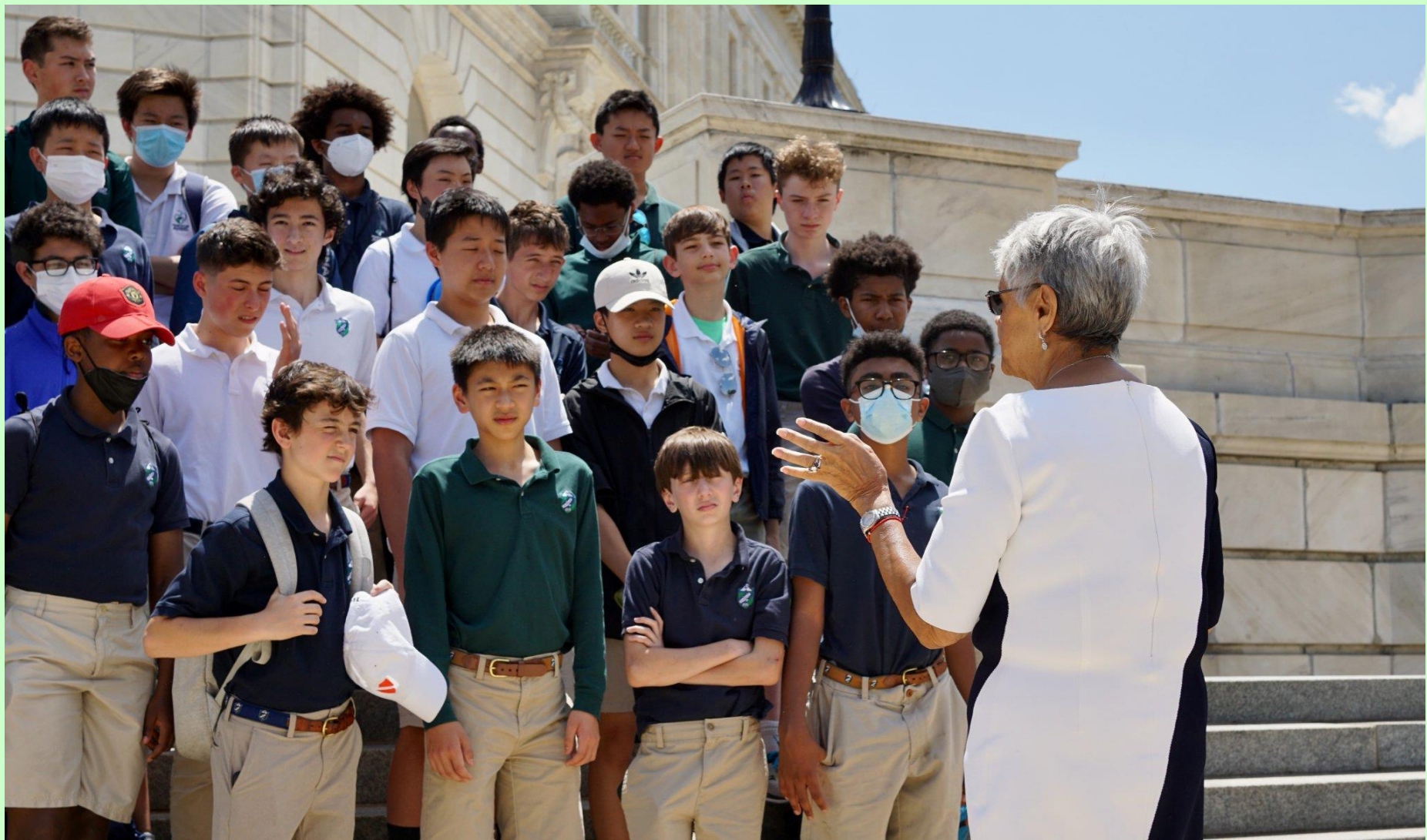
U.S. Congresswoman Bonnie Watson Coleman (D NJ-12)