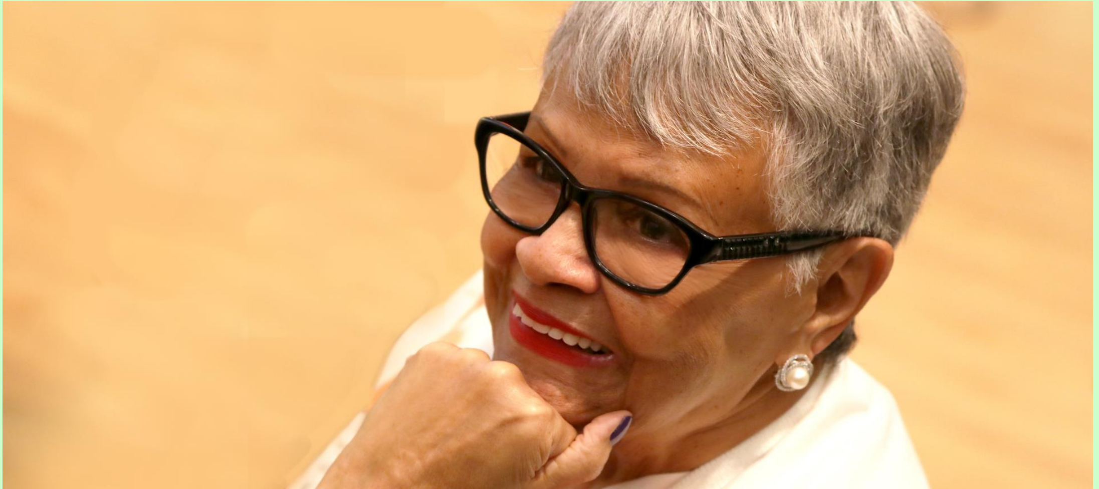
U.S. Congresswoman Bonnie Watson Coleman (D NJ-12)