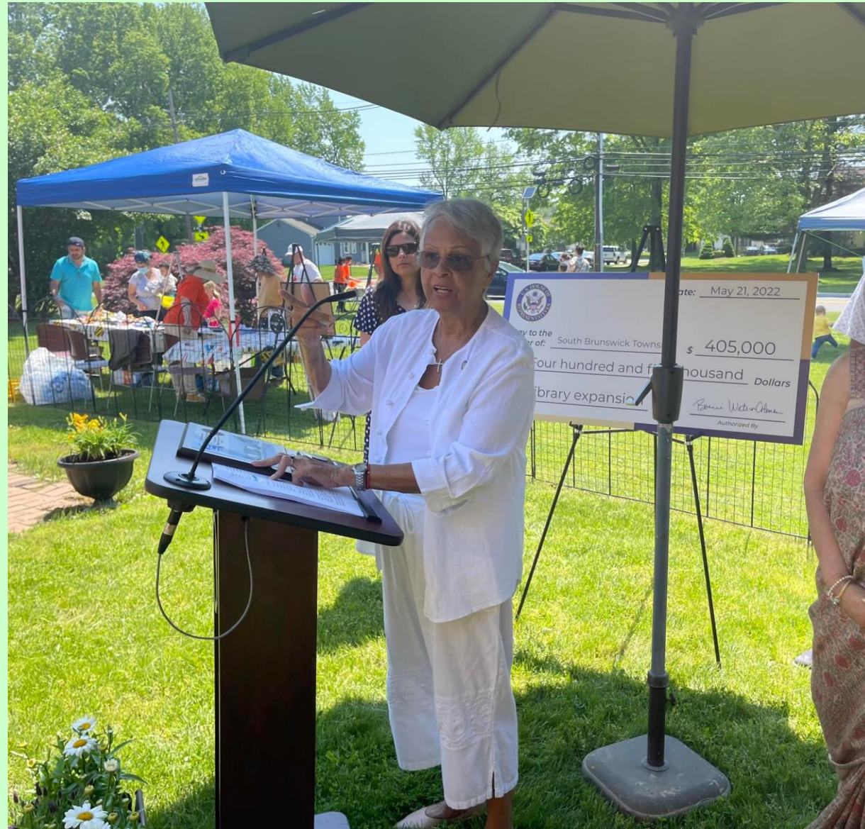
U.S. Congresswoman Bonnie Watson Coleman (D NJ-12)