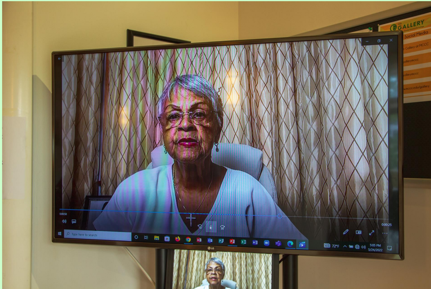
U.S. Congresswoman Bonnie Watson Coleman (D NJ-12)