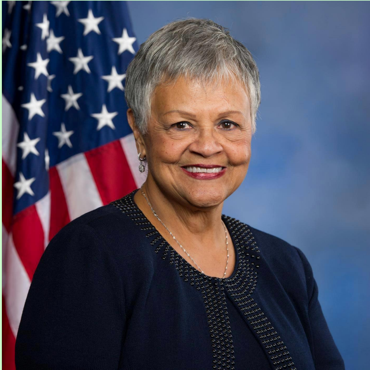
U.S. Congresswoman Bonnie Watson Coleman (D NJ-12)