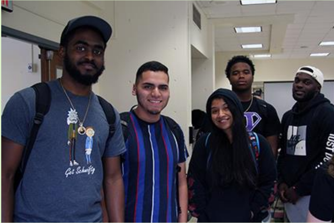
Students were all smiles celebrating the opening ceremony of Mercer's Hispanic Heritage Month.