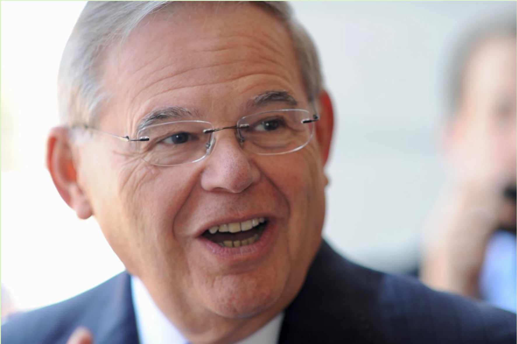
U.S. Senator Bob Menendez