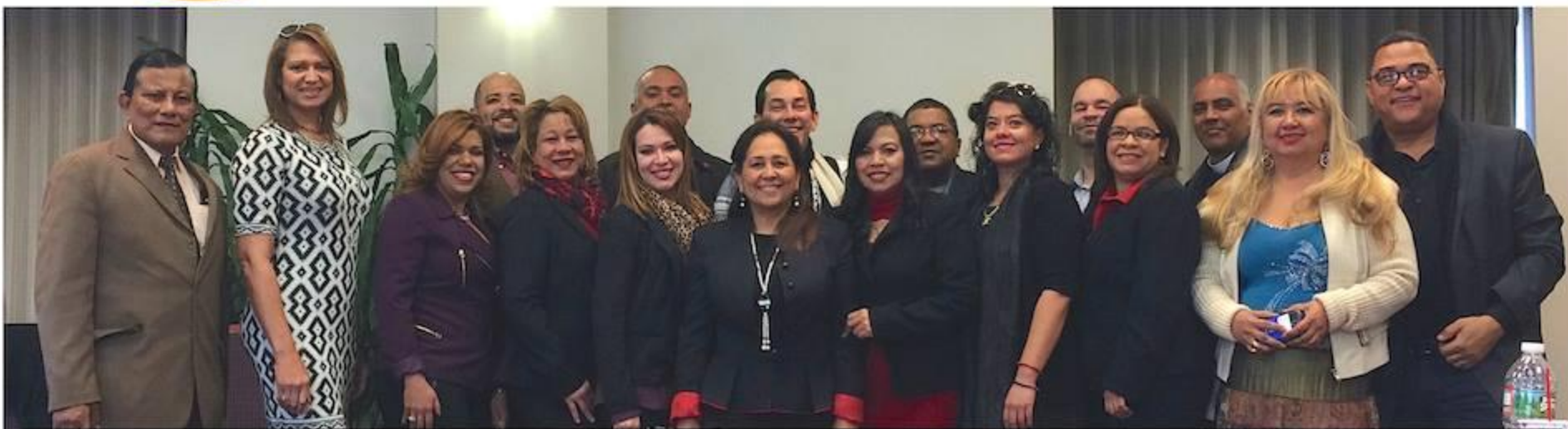
Latino Leadership Academy - Some member of Class of 2017 Graduation: May 2017