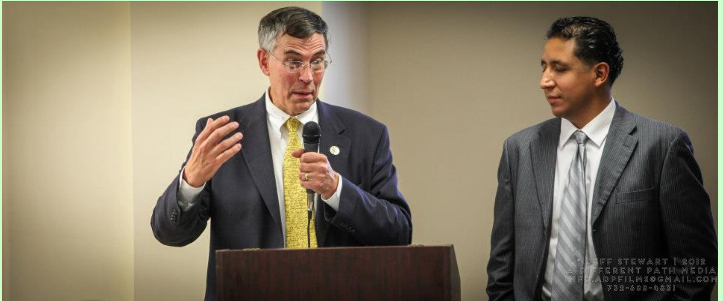
Mercer County Latino Civic Engagement Forum - A roundtable discussion with Congressman Rush Holt, 10/25/2012