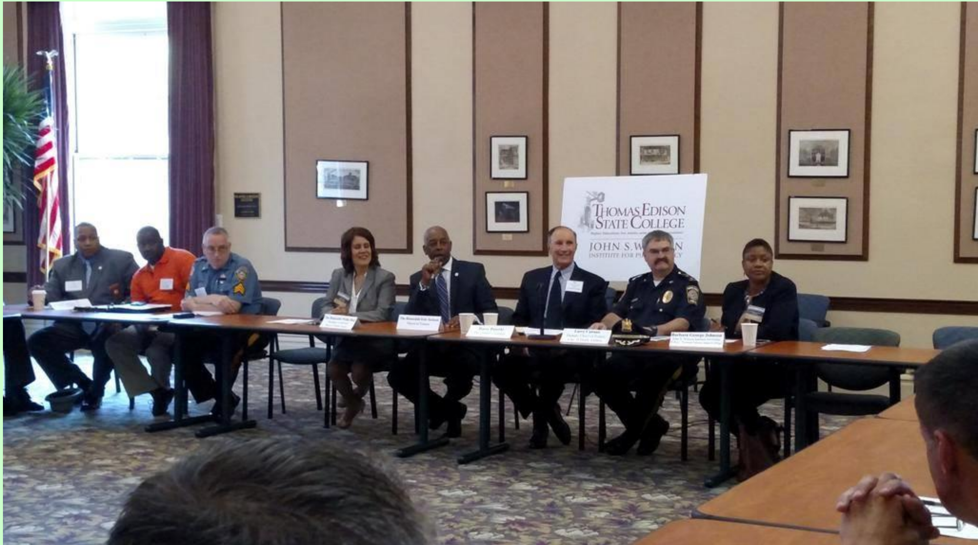
The Citizens Campaign in discussion on auxiliary police in NJ kicks off with welcome & intro from Wilda Diaz, Mayor of Perth Amboy.