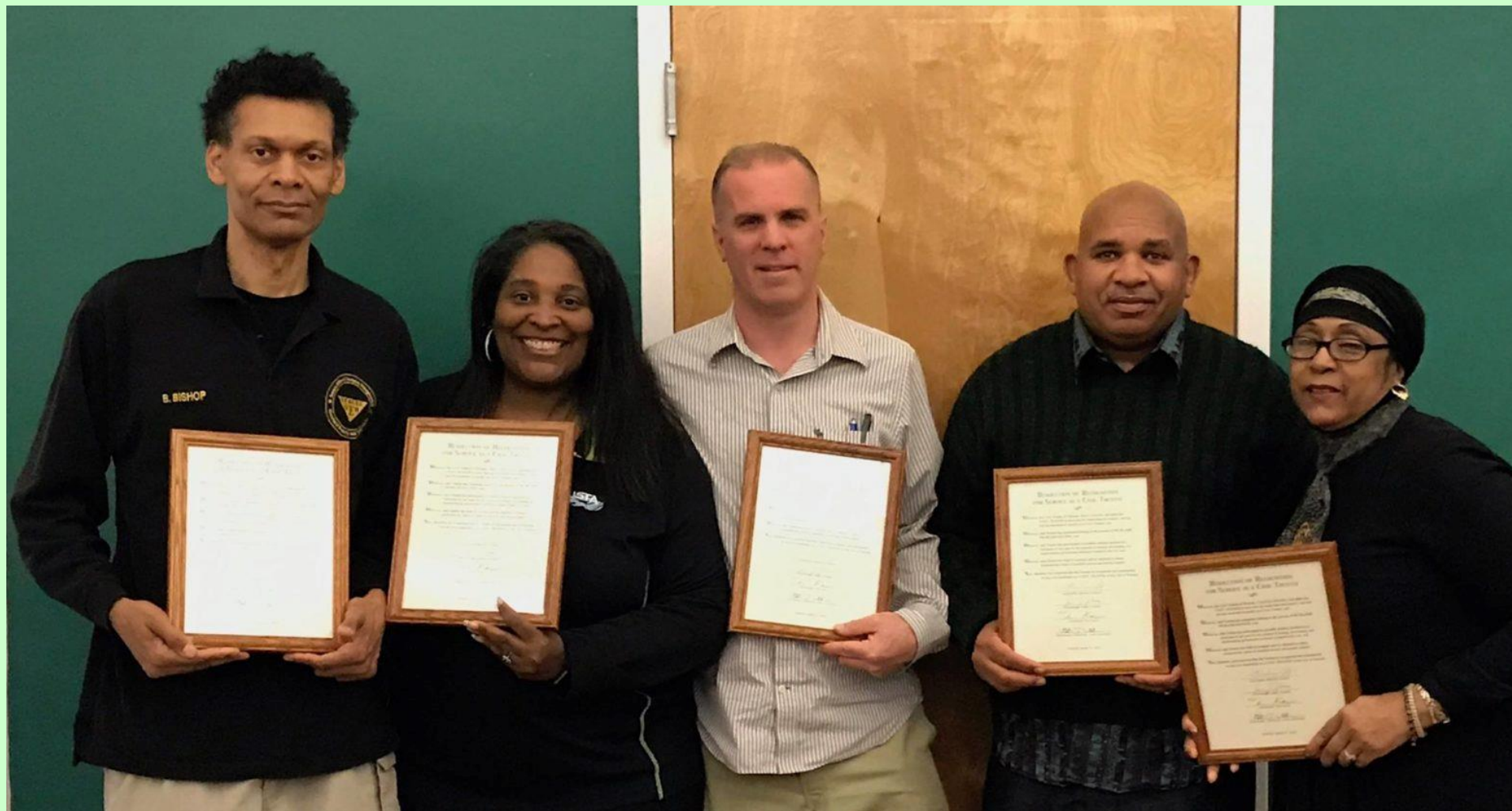
The Citizens Campaign congratulates our Trustees who were awarded a resolution commemorating their service to the Newark Civic Trust. The resolution, signed by former governors Brendan Byrne, Tom Kean, Jim Florio, and Christine Whitman, was presented to the Trustees by Governor Florio at the annual Celebration of Citizen Leadership gala.