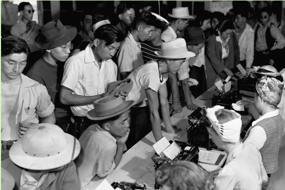
Japanese Americans deal with paperwork at an internment camp in the early 1940s.

New Jersey becomes the second state to sign teaching AAPI history into law, after Illinois last year.