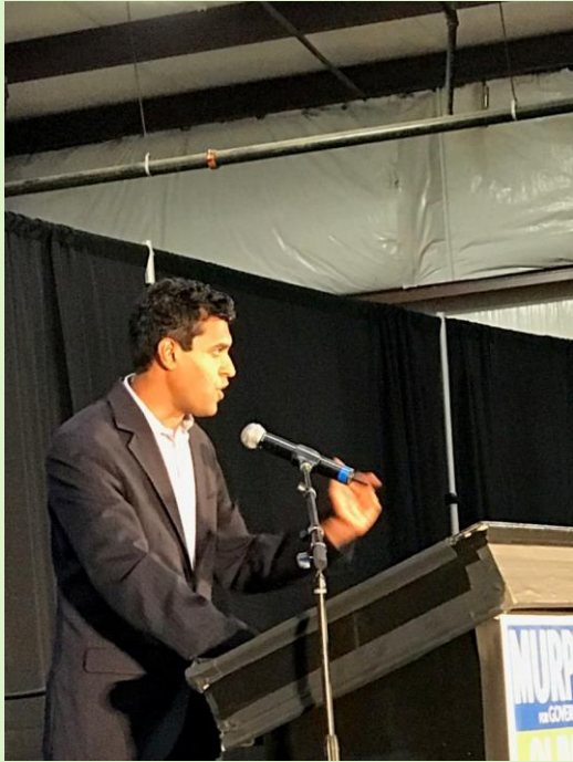
LD11 Senator Vin Gopal

https://www.insidernj.com/a-tribute-to-asian-american-and-pacific-islander-heritage-month-in-new-jersey/