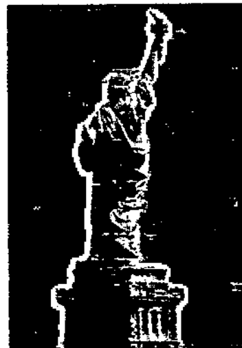
The U.S. has turned its back on asylum seekers

Members of IRATE seek to change the U.S. policy of imprisoning noncriminal asylum seekers and economic refugees through education and advocacy. We also try to provide support and welcome by training volunteers to visit those held in detention. And, we work with the Bergen County Sanctuary Committee to provide community-based alternatives to detention.