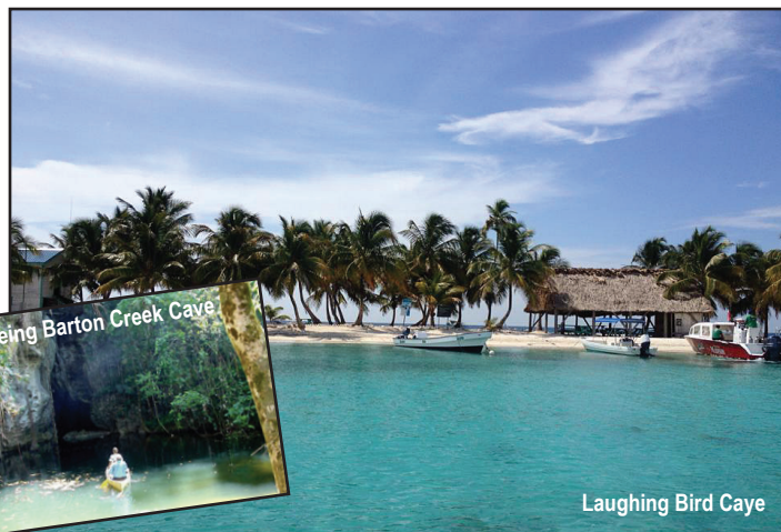
Canoeing Barton Creek Cave