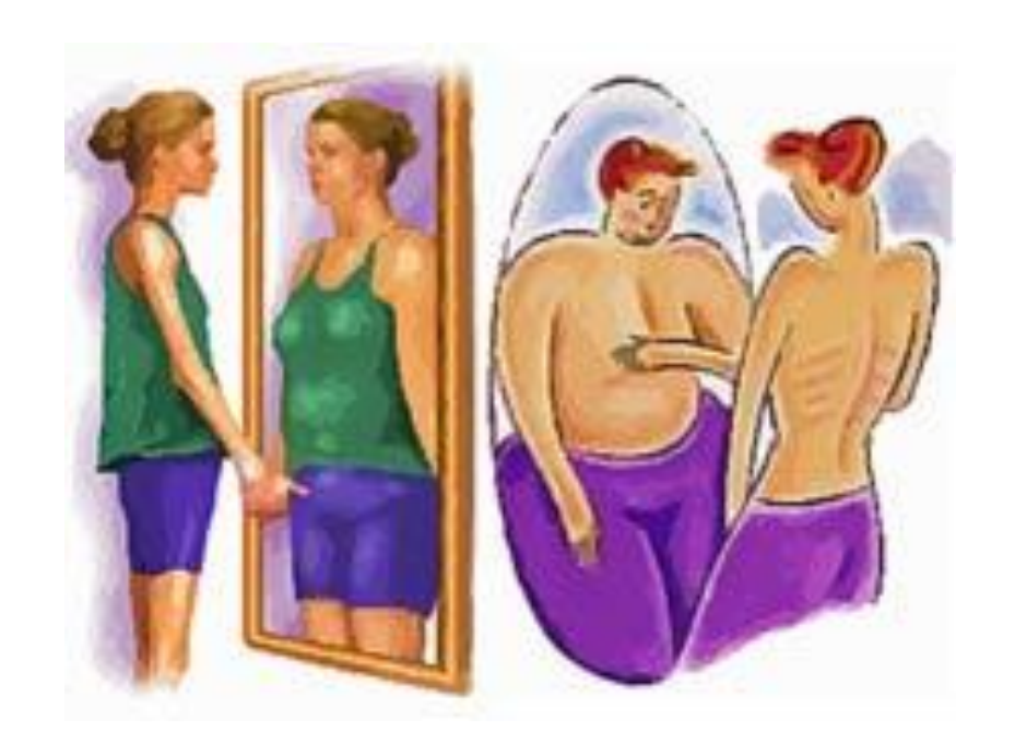
Chapter 8- Eating Disorders