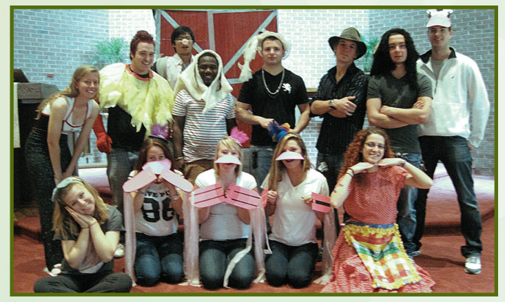
In May, MCCC's Mud Pie Players donned animal costumes for an interactive performance at The Cherry Tree Club, a pre-school serving homeless and atrisk children in Mercer County. The MCCC students, who presented the show as a service learning component of their Oral Interpretation class, made children's picture books come alive as they sang, danced and presented positive messages for their eager audience.