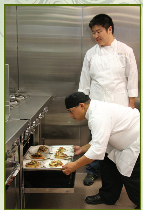
Students at work in the new kitchen in the MCCC Culinary Center.

With the addition of a third fully-equipped professional kitchen at the West Windsor campus in fall 2011, MCCC's hospitality programs offered 14 new courses this year an increase of 73 percent. Enrollment in the A.A.S. Culinary Arts program has increased by 32 percent and new sections have grown by 26 percent.