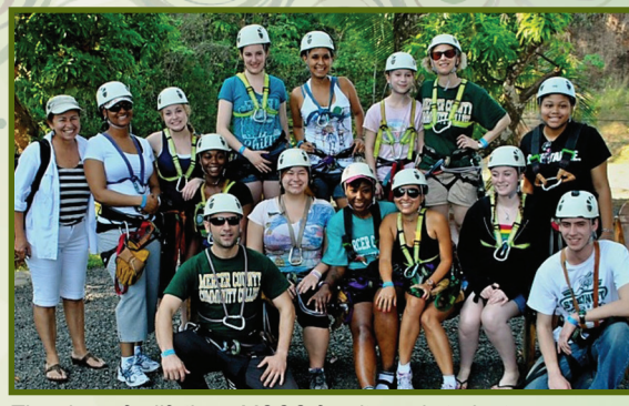
The view of a lifetime: MCCC faculty and students prepare for a zipline tour in Costa Rica.

The South Africa tour group members are pictured outside the University of Western Cape, where they spoke with faculty and students about sociological and historical issues affecting their lives.