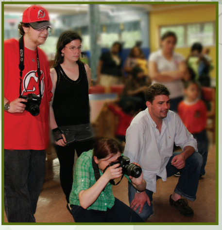
Photography majors donated their time and talent to make family portraits for about 25 mothers with their children. The photographs were printed using materials supplied by the students and given to HomeFront, an organization that supports homeless families in central New Jersey.