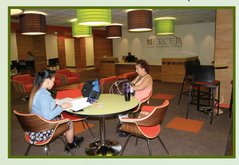
The new Student Commons serves as a meeting and study destination at the Trenton campus.

At left, Trenton Hall houses the new Fashion Design and other arts programs.