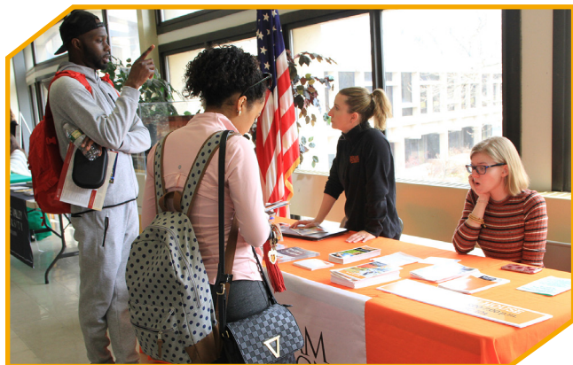
Mercer County Community College

For many students, the transfer experience is made easier by “guaranteed transfer admission” and “program articulation” agreements between Mercer and other colleges. See page 15 for further details concerning transfer opportunities.