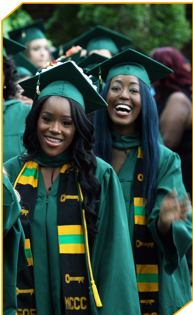
Mercer County Community College

Students are notified of their potential graduation status four weeks before the graduation date. Diplomas are available within eight weeks following the end of the graduation term. For more information about the certification process or specific dates, e-mail graduation@mccc.edu .