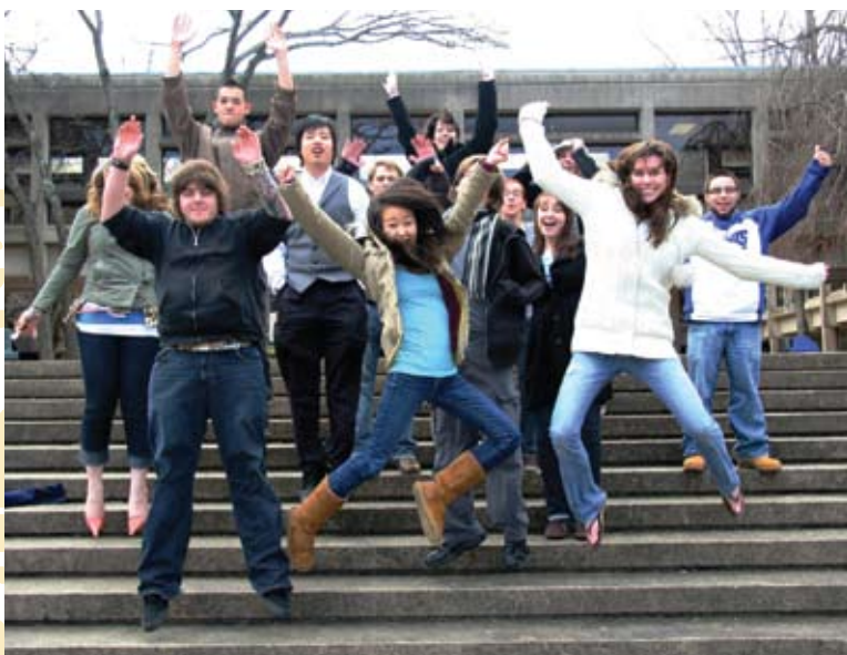
Exuberant staff members from The College Voice