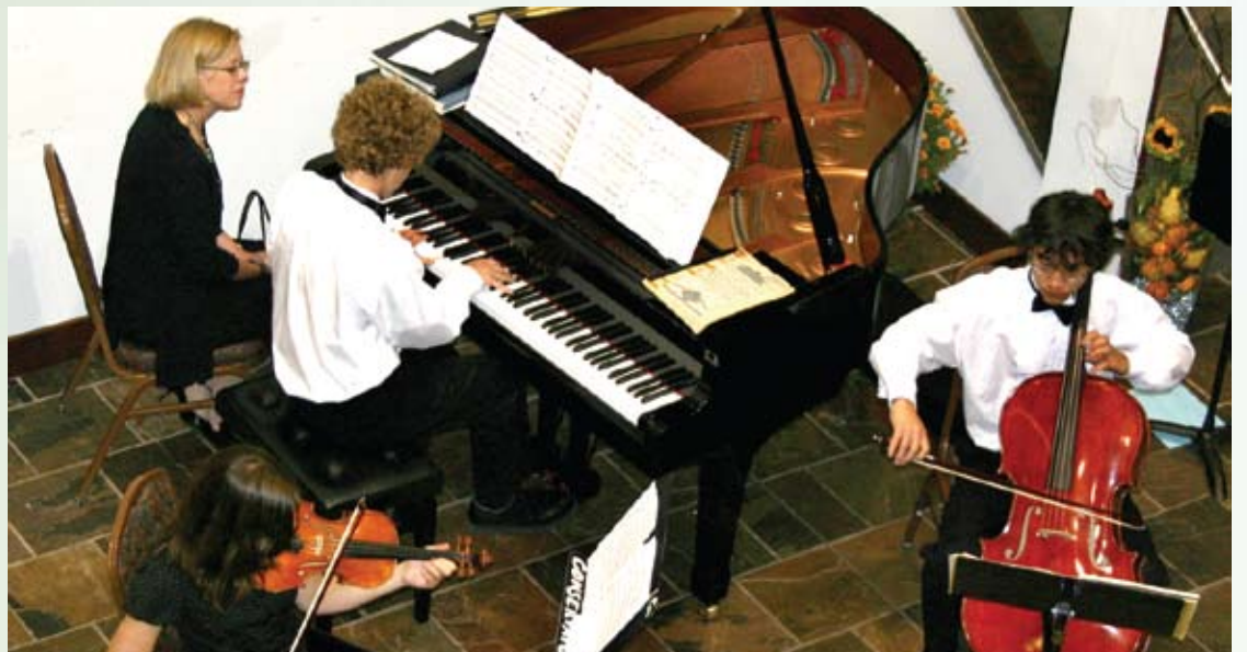
Student musicians from the Westminster Conservatory at Westminster College of the Arts of Rider University perform at WWFM's 25 th anniversary celebration.