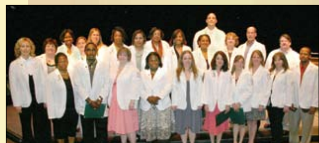
The May 2008 Nursing program graduates brought the year's total to 60.