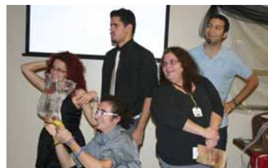
Guests enjoyed a performance by MouthWorks, an improvisational student performance troupe. The students offered advice and told stories about unique opportunities at Mercer.

Among other highlights were music by the MCCC Jazz Band, dessert prepared by culinary students, a carving station presented by Career Training Institute student chefs, and hors d'oeuvres served by the Conference Center staff.