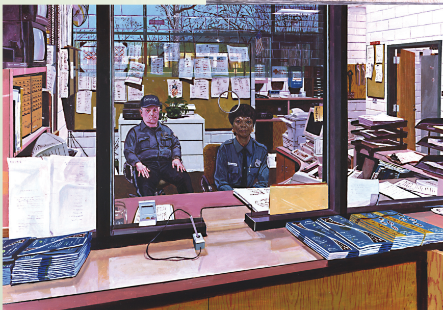
College Security Office