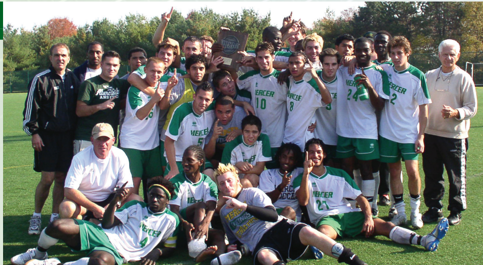
The Vikings celebrate after winning the Northeast District Tournament.

Facing Bryant & Stratton on Nov. 6, the Vikings had a tougher time but still controlled