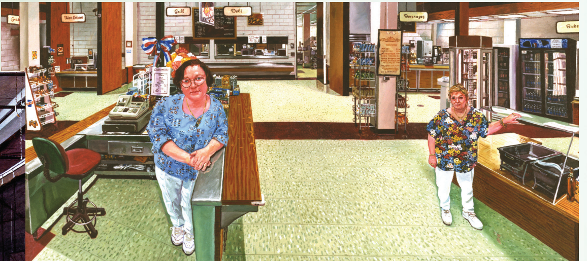
The College Cafeteria