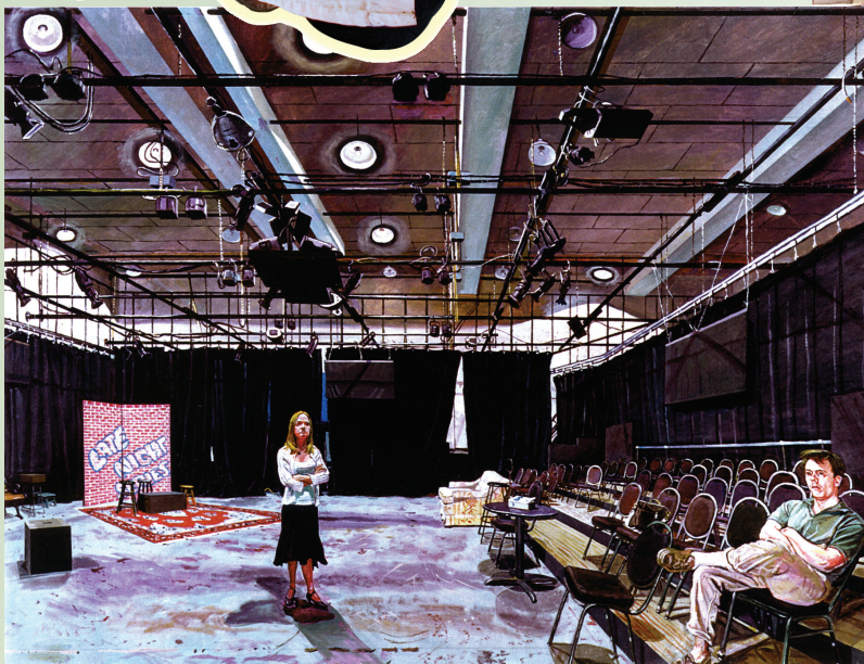
The Actors in "A Doll House"