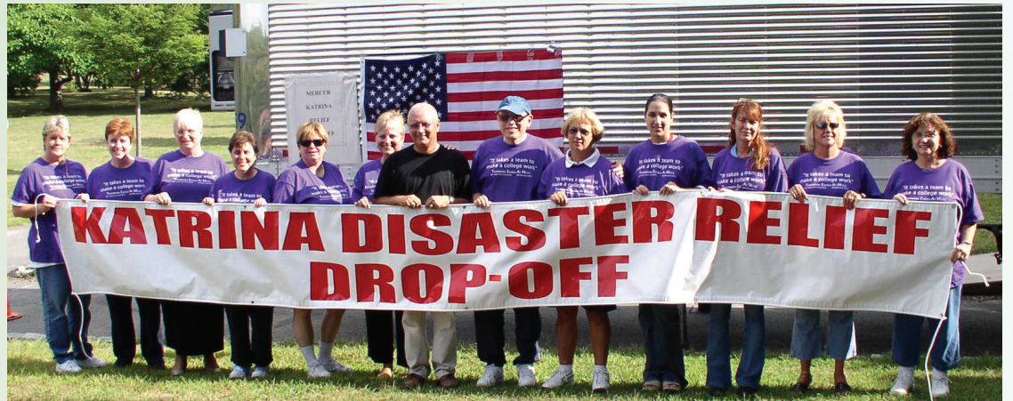
Staff and faculty volunteers pose with a sign prepared for the side of the tractor-trailer truck which was driven by three professional drivers who volunteered their services.

College staff and faculty have "adopted" the town of Belle Chase and its hard-hit citizens. In October the college's Katrina Relief Committee organized and packed a second truckload, this time with donated winter clothing. In December a large supply of holiday gifts was sent to needy children and their parents.