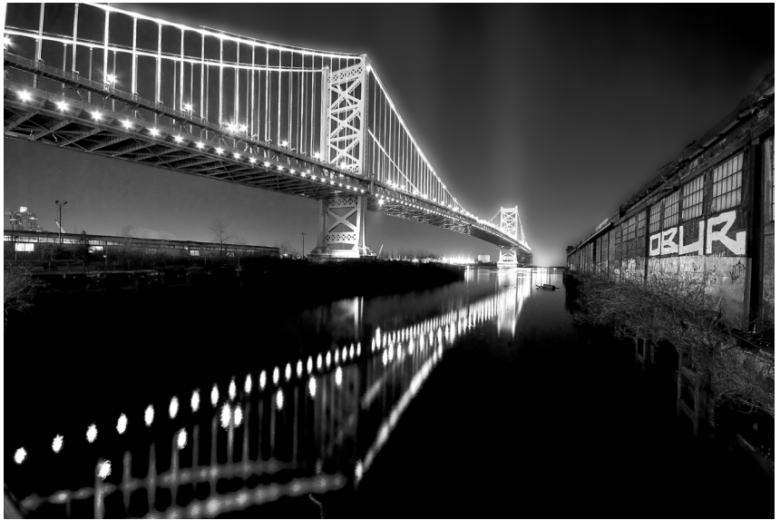
—2 Bridge Lighter blur Chris Szokolczai