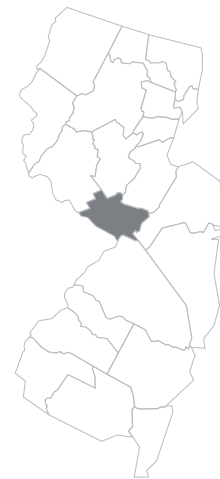
MERCER COUNTY, NJ

MCCC influences both the lives of its students and the county economy .