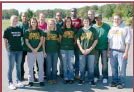
Student athletes who assisted at the tournament included soccer, softball, basketball and baseball players.