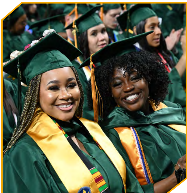
Mercer County Community College

Students will be notified via email when their degree or certificate is confirmed. Questions may be directed to graduation@mccc.edu